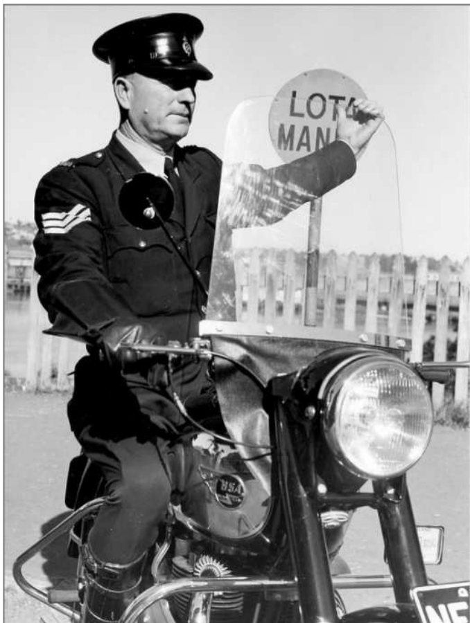
Motorcycle Policeman on a BSA - Brisbane