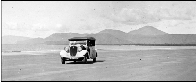
Driving on the beach, Port Douglas c 1935

without making a negative impact on the carbon footprint."