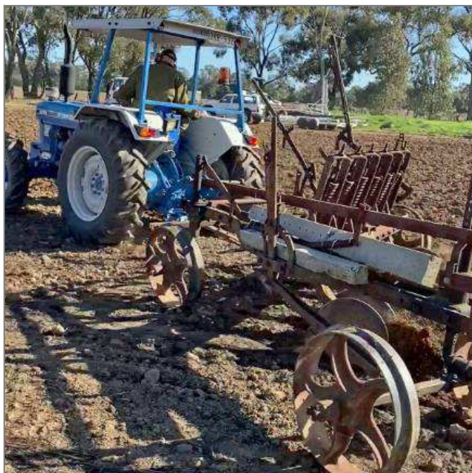
Starting the Field Marshall

After a couple of months of anticipation the date was set for the members of the Club to tackle the ploughing of 25 acres on the outskirts of Bendigo. Two weeks ago the Ploughing Committee moved the ploughs back from Kamarooka. Then we moved some equipment on site on the Friday and then Saturday morning at 8:00am we were ready to make a start. Our job was to prepare it for planting of Lucerne later in the year.