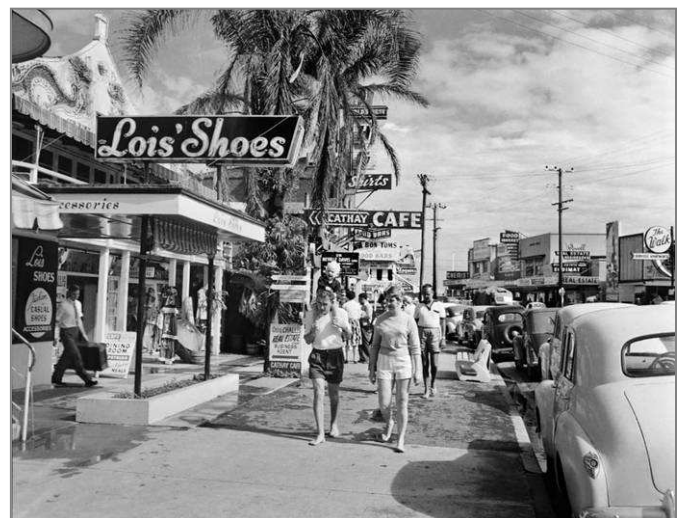
Surfers Paradise, CC 1960

If you wish to be added to the distribution list please email the Editor.